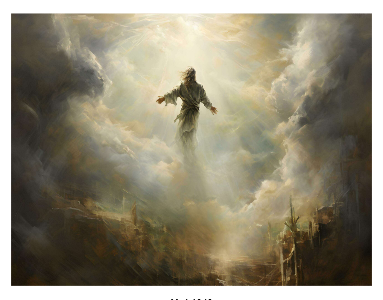
Mark 16:19 "The Lord Jesus, after he had spoken to them was taken up into Heaven and sat down at the right hand of God."